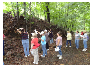
Participants search for a geocache